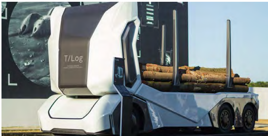
T-Pod, Autonomous semi – Sweden (DB Schenker & Einride)