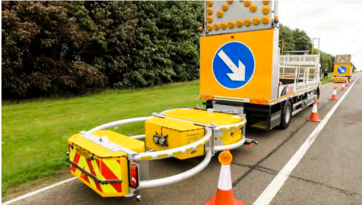
Truck mounted attenuator - Colorado