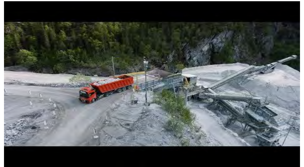
Autonomous dump truck fleet – Norway (Volvo)